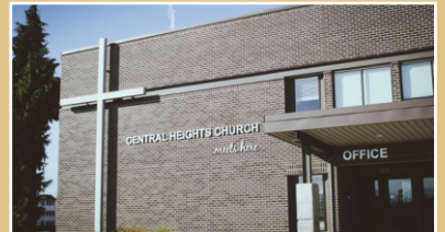
Central Heights Staff & Ministries