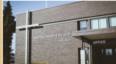
Central Heights Staff & Ministries