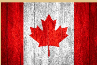
Pray for Canada