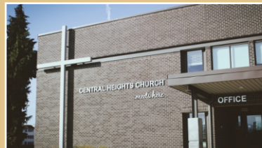
Central Heights Staff & Ministries