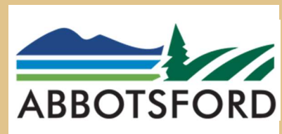
Pray for the City of Abbotsford