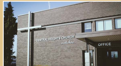
Central Heights Staff & Ministries