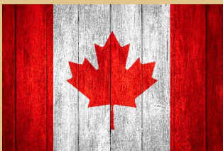
Pray for Canada