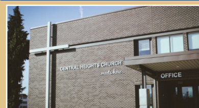
Central Heights Staff & Ministries