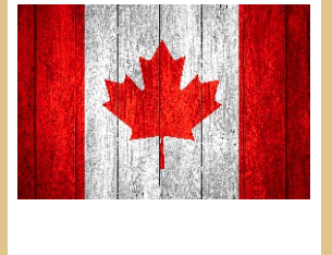
Pray for Canada