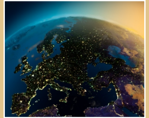
Please pray for our Missionaries in Limited Access Countries