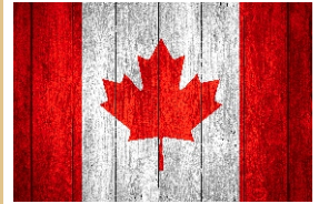
Pray for Canada