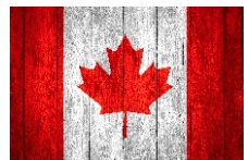
Pray for Canada