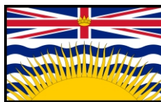
Pray for the Province of BC